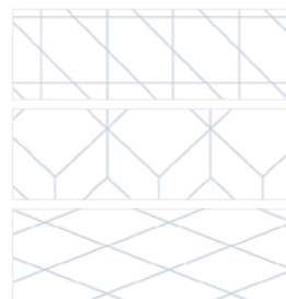
Brick Line White 11x33,15 / 4,3"x 13,1"