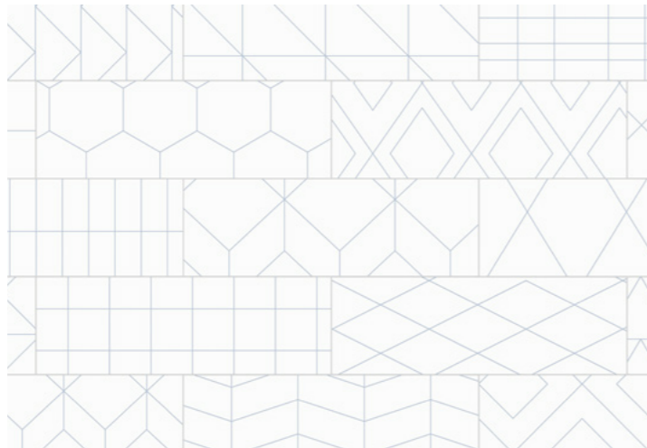
Brick Line White 11x33,15 / 4,3"x 13,1"

This visual amalgamation is emphasised by the use of digital material, which is used to print delicate silver outlines onto the monochrome white background.