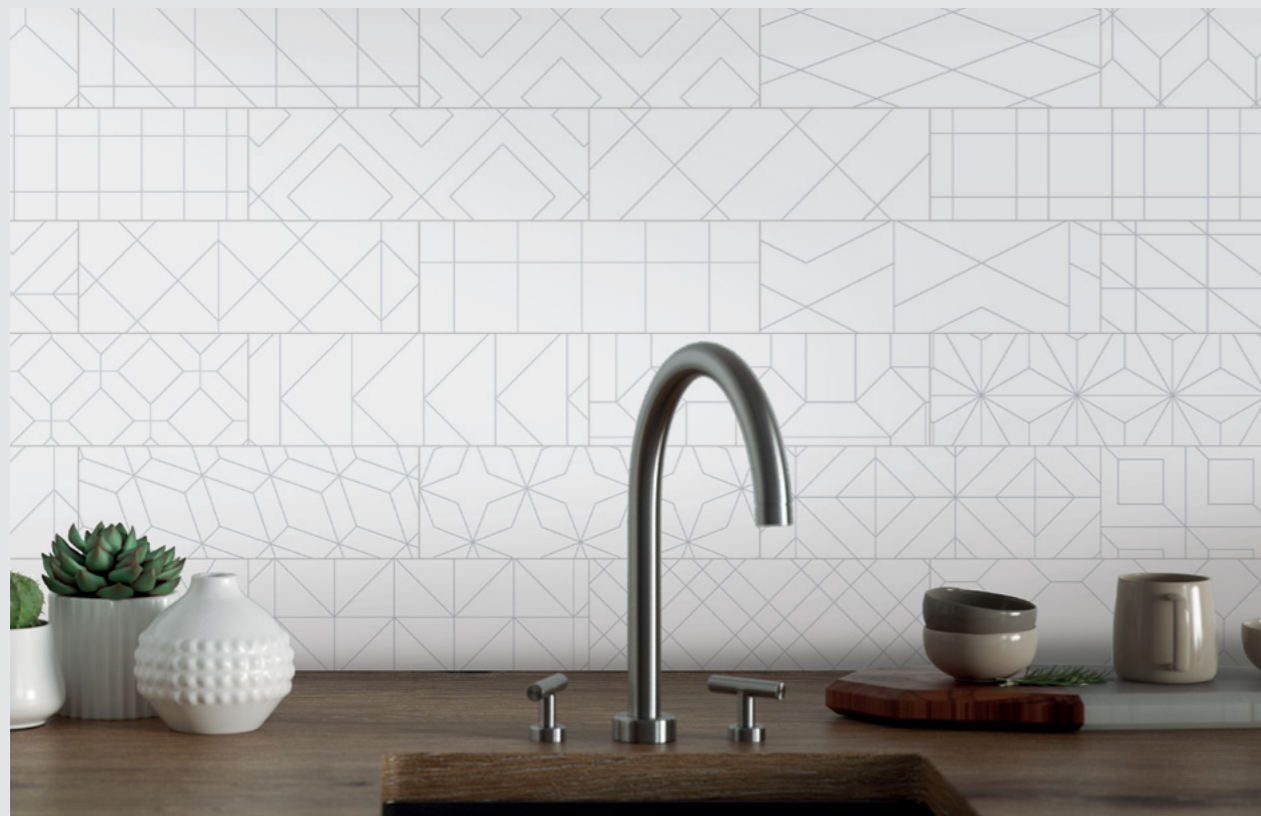
Brick Line White 11x33,15 / 4,3"x 13,1"