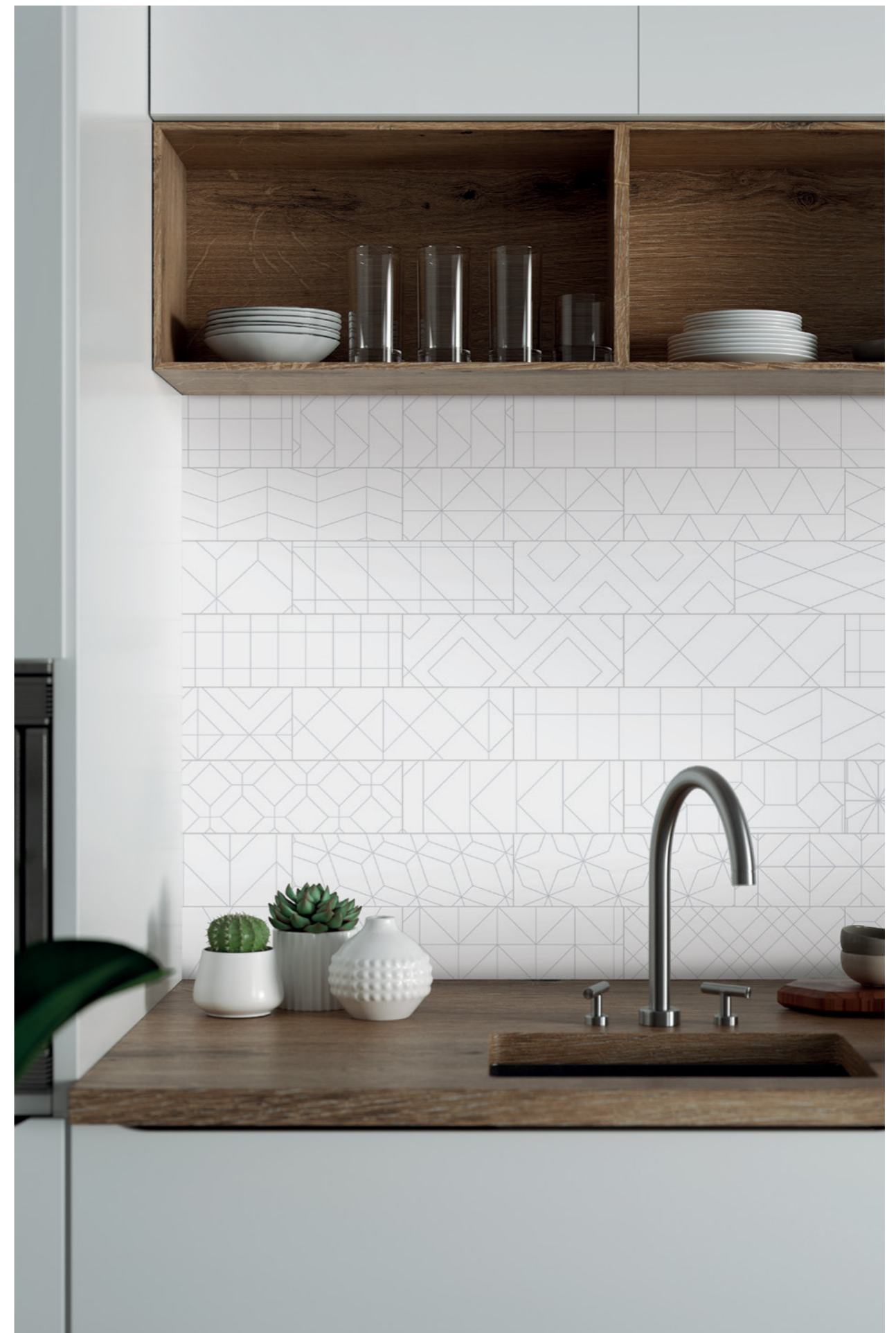
Brick Line White 11x33,15 / 4,3"x 13,1"