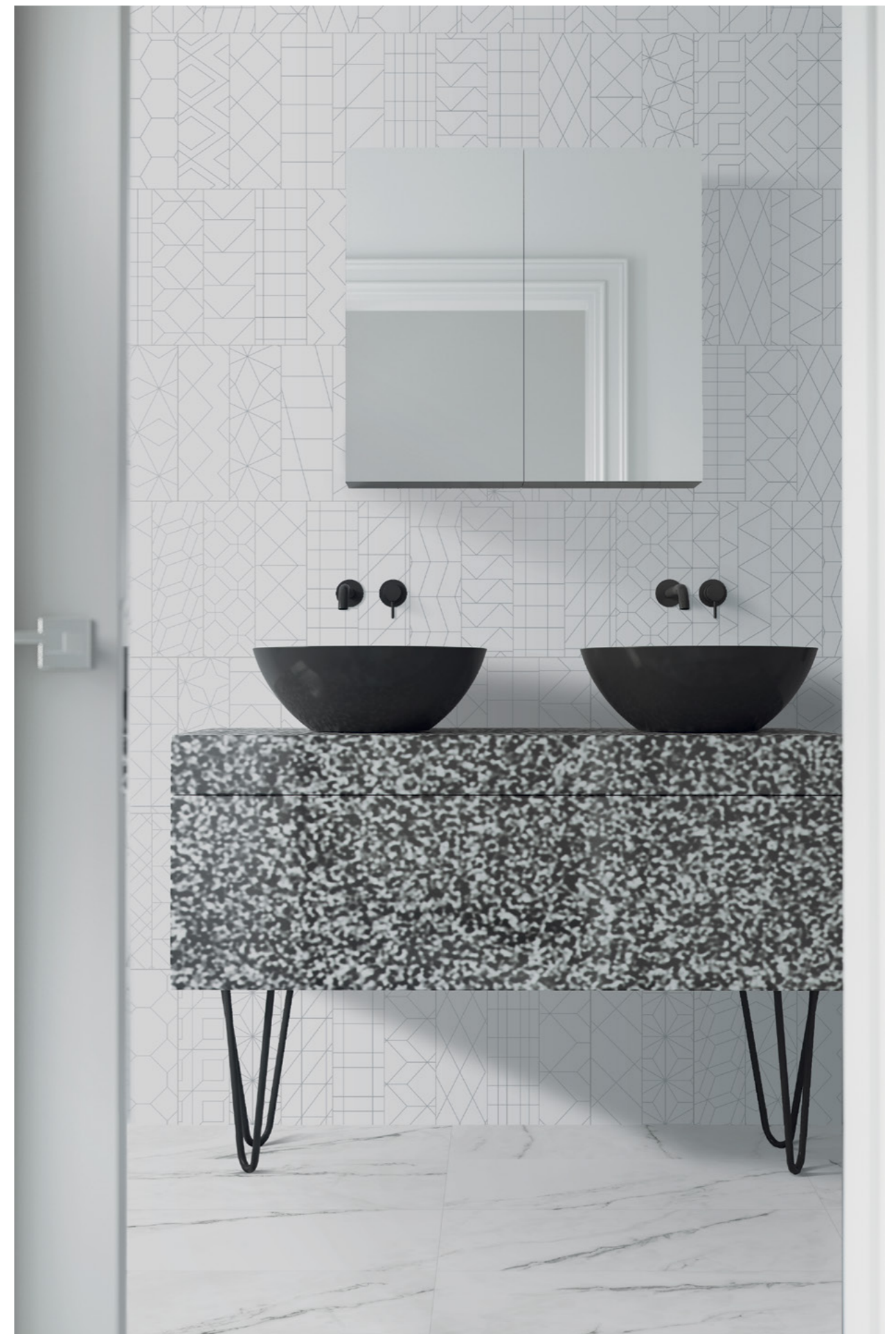
Brick Line White 33,15x33,15 / 13,1"x 13,1"